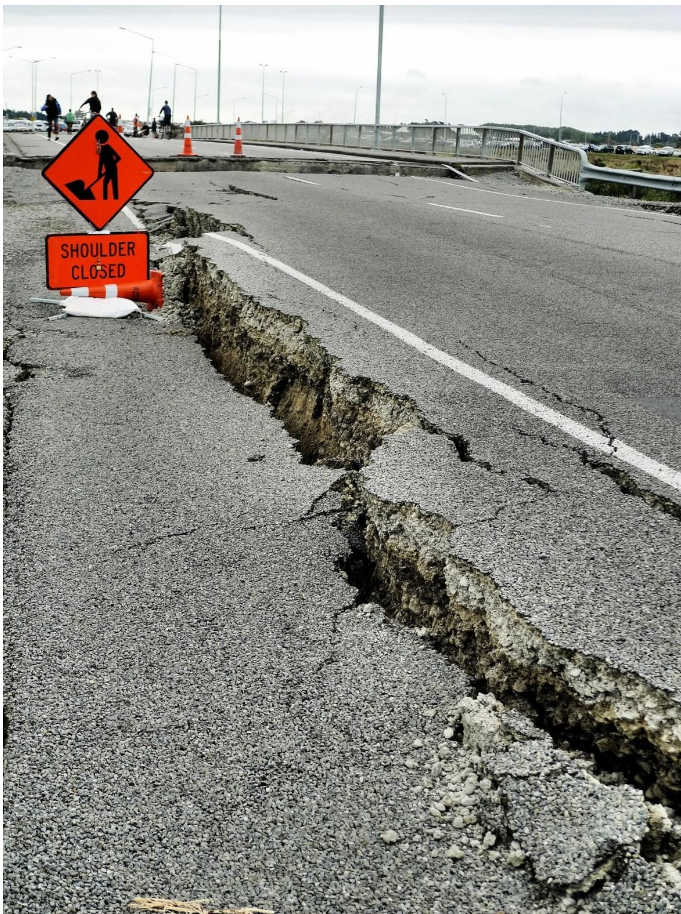
Damage after a powerful earthquake in New Zealand in 2011. Researchers at UT Austin are working to forecast earthquakes with artificial intelligence.